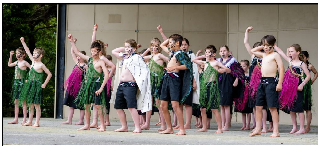
who gifted these taonga to each school in the Upper Hutt cluster.